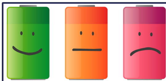
IV Iron Infusion Brochure 2025

Inform staff IMMEDIATELY if there is ANY discomfort, burning, redness or swelling at the injection site. Severe side effects (e.g. a serious allergic reaction) are rare. You will be closely monitored for any signs of these during (and for at least 20 minutes after) the infusion by nursing staff.